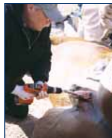
Hold drill and Henderson Instrument in a straight line with the cord.

Product # 29900 – Henderson Equine Castrating Instrument with Informational