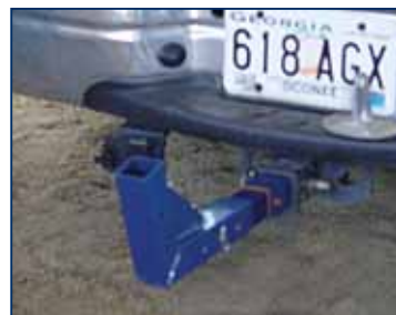
Fast, easy set-up – (See Figure A above for reference to item #)

1. Insert Hitch Receiver Assembly (item #1) into class 2 or 3 hitch.