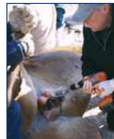
Turn drill clockwise slowly for 4 to 5 turns. Speed can be increased after the initial turns.