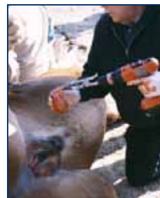
After 20 to 25 turns, the tunic will fracture tying off the cord which dramatically reduces bleeding.