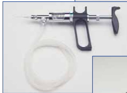
Socorex Syringe with Feed Tube