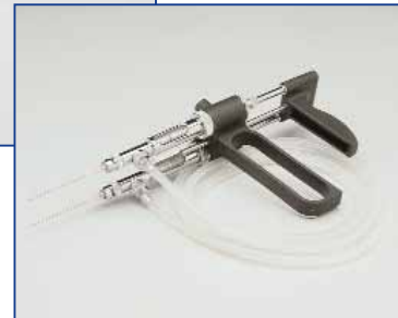
Socorex Twin Syringe with Feed Tubes