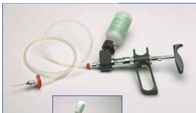
Slap-Shot shown with Socorex syringe